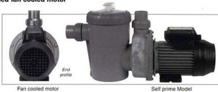
Fan cooled motor

Don't settle for anything less. Specify the "Filtermaster" for your new spa or pool.